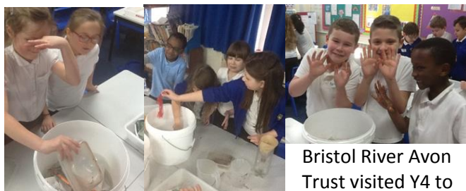
Bristol River Avon Trust visited Y4 to

talk about water pollution linked to their Reduce, Reuse, Recycle geography project. They experimented with filters to try to clean river water, which was an amazing learning experience as well as lots of fun!